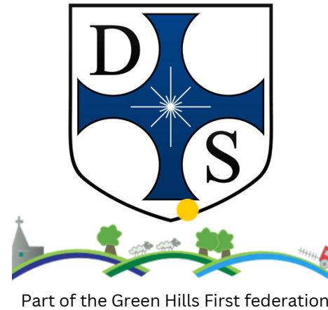
Part of the Green Hills First federation

A huge warm welcome back to school to our existing families and pupils and a very warm welcome to our new starters and their families too. I hope you all had a fantastic summer, despite the weather.